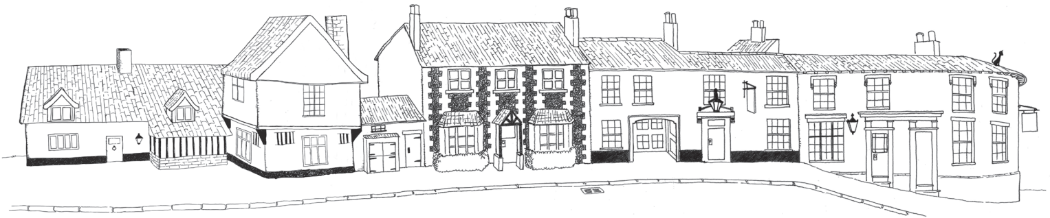
the crown Hartest